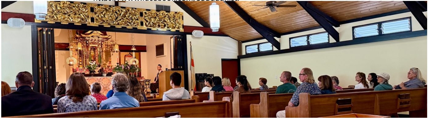
Figure 1 Thanks to all who joined us for Hanamatsuri and April Shotsuki Hoyo. Great community (Sangha)